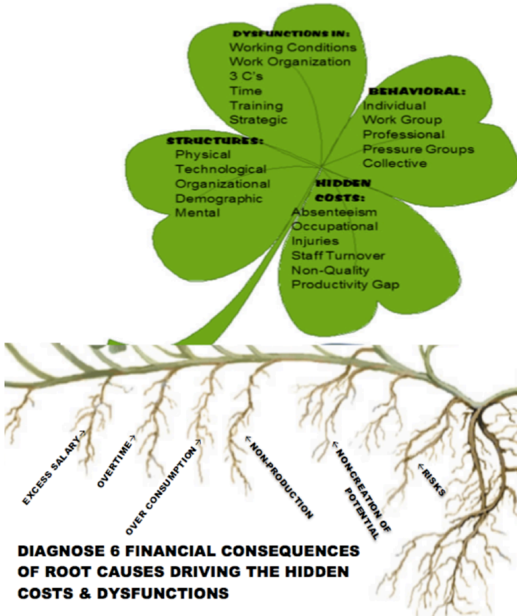
Figure 1 – SEAM 4-Leaf Clover and the 6 Stem-Roots of the Rhizome

In examining the SEAM 4-Leaf Clover dysfunctions are identified and diagnosed, the nature of the negative is to hold out the possibility that negative can be transformed into positive results in terms of developing untapped human potential, increasing the value-added by preventing and managing dysfunctions, using freed up time and material resources to pursue value-added strategies.